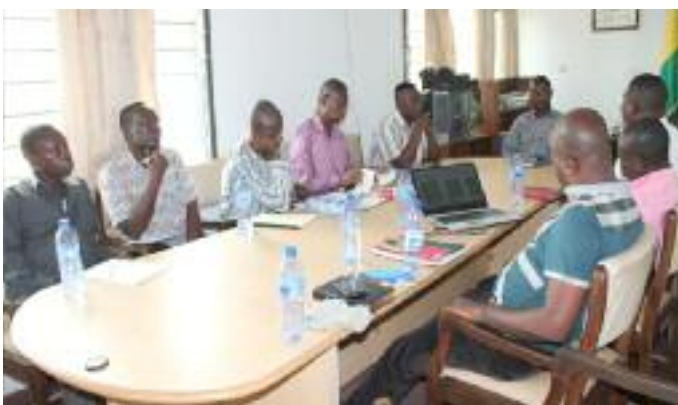
Collaborative meeting with district assembly