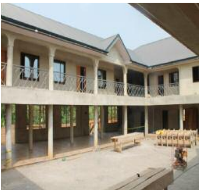
The Community Centre at Hweakwae

The Newmont Akyem communities have rich cultural heritage which date back from century. The ways in which events such as funerals are organised for the dead, marriages are contracted, divorces are sanctioned as official and naming ceremonies are done have become part and parcel of their social and spiritual life of the communities. It seems therefore important that these traditions are preserved for generations yet to come. As a result, some interventions were made through the provision of regalia and infrastructure to sustain and preserve these traditions. The regalia include traditional furniture, clothes, Chairs and umbrellas. The completion of Chief's palace and Durbar Ground (Conference Room) at Afosu, completion of Durbar Ground, and construction of 3-Bed Room Chief's Residence at Resettlement also represent example of cultural heritage infrastructure projects.