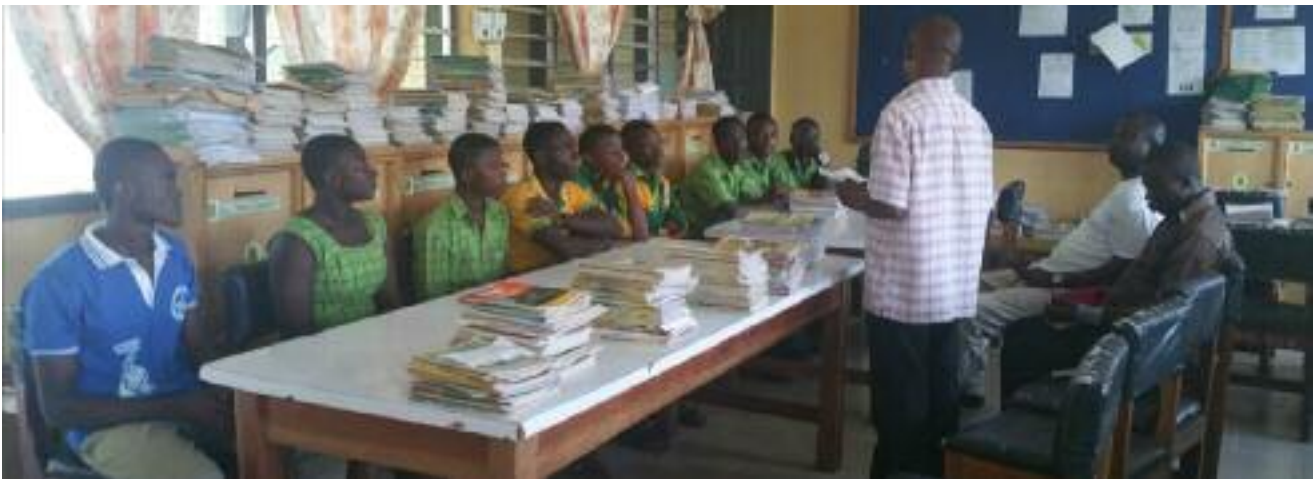
Interactions with Assistant Headmaster and scholarship beneficiaries at Oda Senior High school during monitoring visit