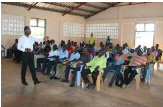
Classroom training session of watchdog committee members