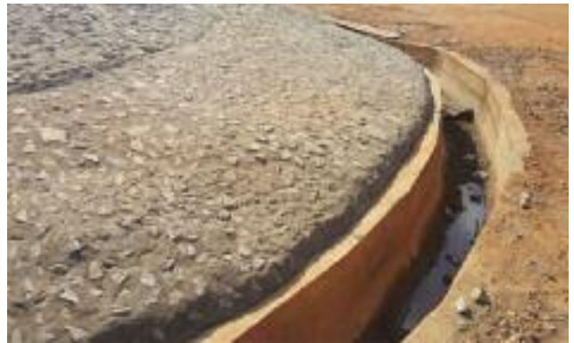
Adausena road U-drain and stone pitching