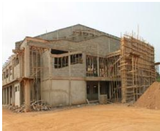
The social centre at Adausena

and Hweakwae was to serve as a convenient place for social gathering. Initially, gathering in the above stated communities mostly took place on a football field or a portion of the road is blocked to serve the purpose of the gathering. To eliminate this inconvenience, it was deemed important to construct social centres for Adausena and Hweakwae. Other objective of the social centres was to provide avenue for the youth to meet to undertake some sporting activities as well as accessed information necessary for their personal development. The social centres have been presented below.