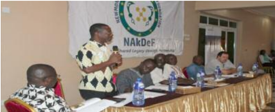
Managing Partner of Nexia-Debrah presenting the auditor's report