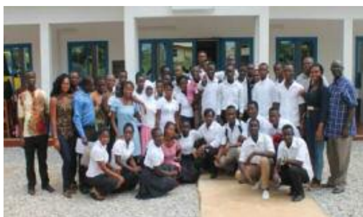
Group photo of Asankare sch. Beneficiaries Asankare sch.