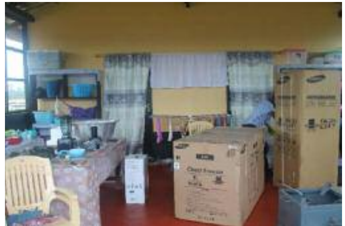
Plate 10: Items presented to school feeding food vendors

The food vendors who were selected to render catering services to Yayaaso basic school and Ahausena Methodist basic school were supported with start-up kits with the twin objective of creating employment and ensuring economic empowerment within the Akyem communities. Items that were provided to them included refrigerators, cooking utensils, bowls, LPG cylinder and cooking stove. Image of the items provided are shown below.