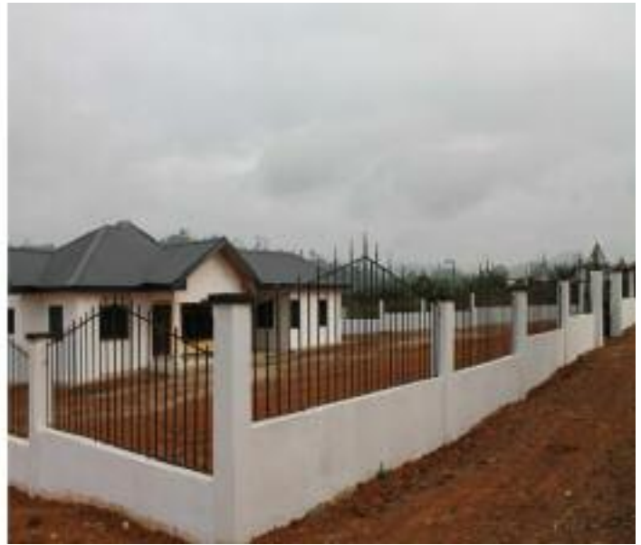
The chief's palace at Resettlement