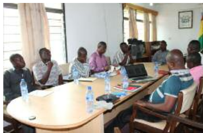
Plate3: Meeting with the leadership of Birim North District Assembly