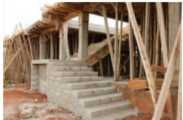
Plate 10: Afosu Market:

Another intervention with regards to the goal of ensuring improved economic activities within the Akyem communities was the Construction of Afosu market structure. The market construction is currently at the second phase. It is expected that the market structure will provide a convenient environment where buyers and sellers can transact business. The market is likely to attract traders and farmers from surrounding villages leading to improved economic activities within the Afosu community.