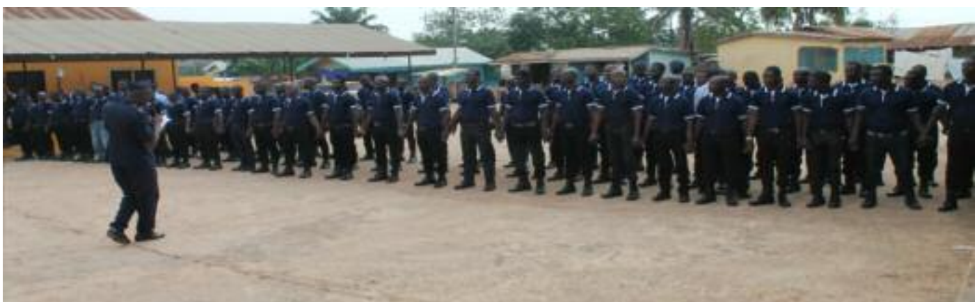
District Police commander administering the watchdog committee membership oath at the inauguration ceremony