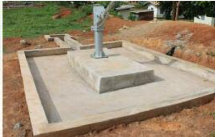
One of the 2 boreholes at Resettlement