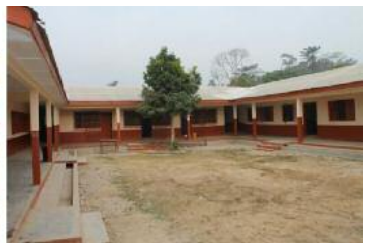
Renovated 6-unit Primary for Ntronang