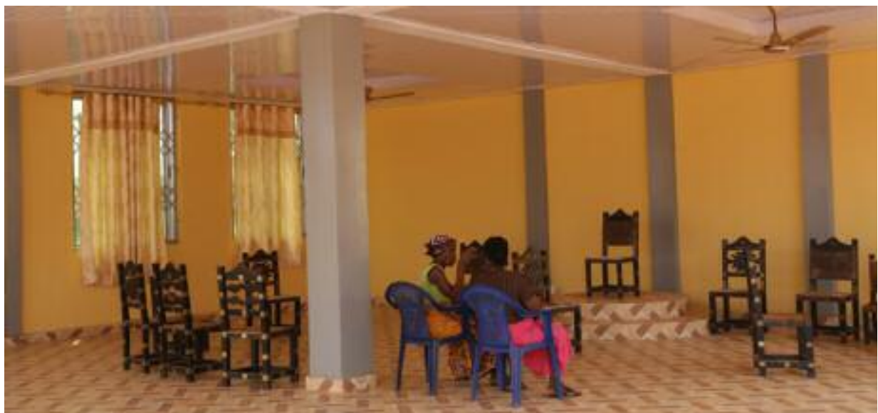
Open area at the ground floor of Afosu Chief's Palace