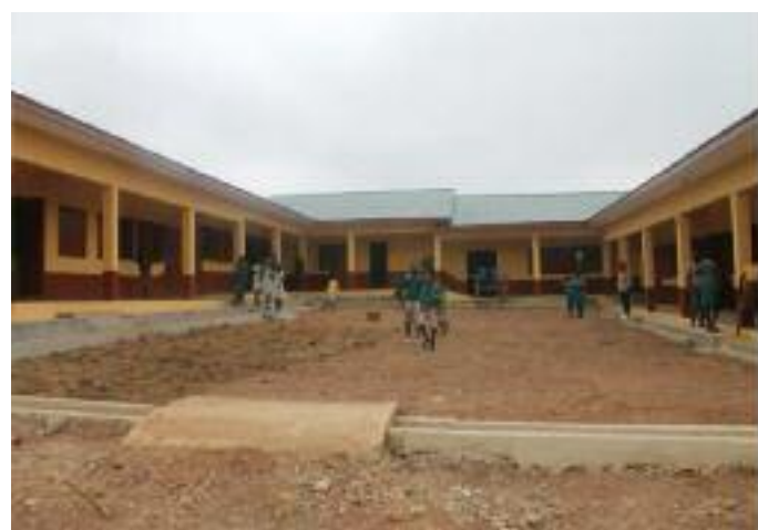
6-unit primary school block for Afosu