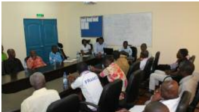
Plate 1: Meeting to review and improve upon the delivery of the scholarship programme

• Development of Monitoring and Evaluation Mechanisms Proposal was drafted for baseline data collection. Survey instruments were designed for primary data collection; however the field work was not carried-out due to overstretched human resources. Secondary data was gleaned for baseline data. Logical Framework Matrix (LFM) was developed for ASSIST Program. The completion of the baseline field data collection and other M&E mechanisms have been planned for completion in 2017.