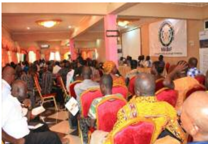
Plate 2: Pictures of 2016 AGM