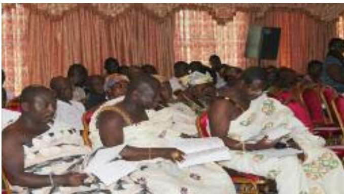
Community chiefs and stakeholders following along with the presentation of the auditor's report