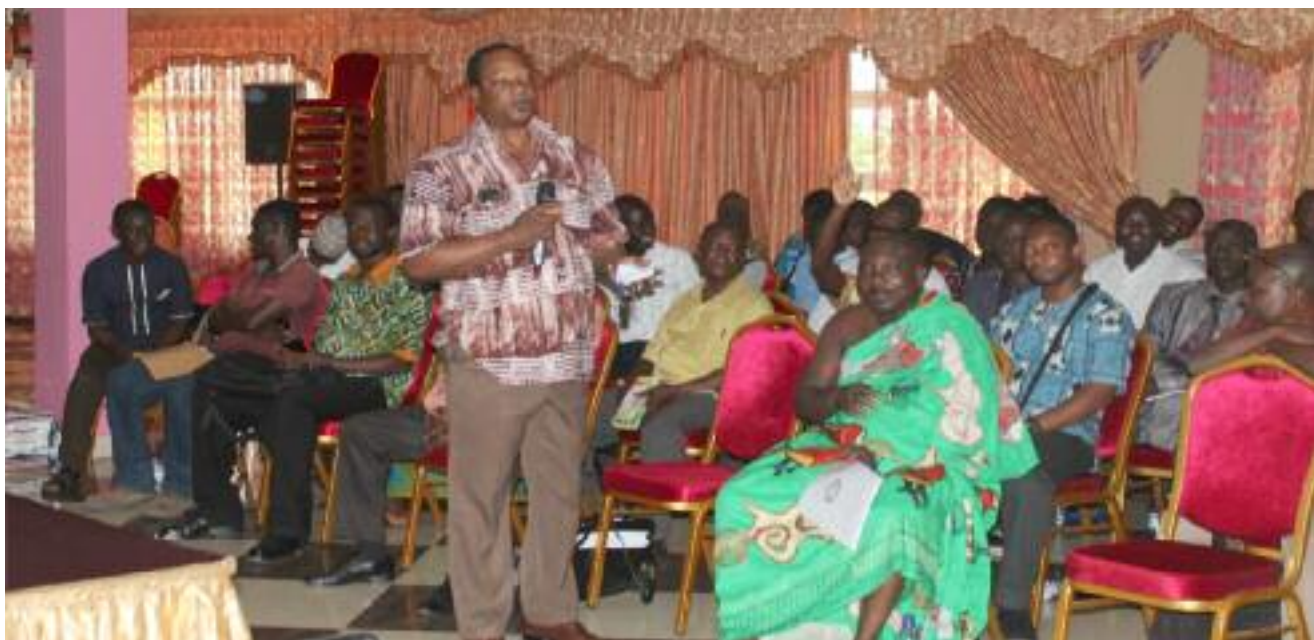
The District Education Director making contribution during the Action Planning session of the of the EQUIP program