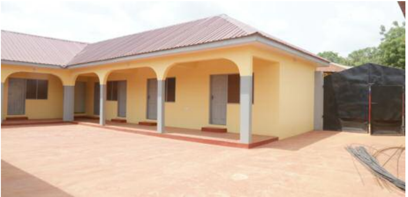
Compound of Afosu Chief's Palace