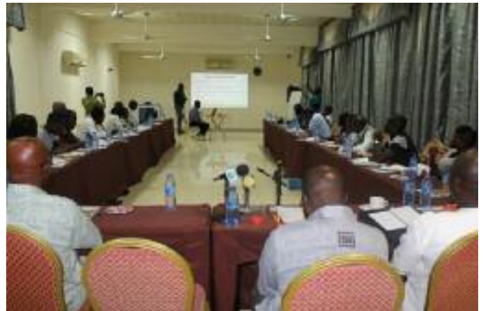
NAkDeF media workshop in Koforidua