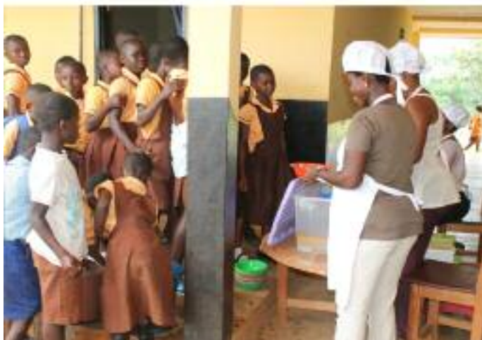
Plate 6: Food being served to school children

Some of the students had to spend lesson hours eating from home. Consistent to the findings was that of the Centre for Social Responsibility in Mining's (CSR) review conducted in 2013 which revealed malnutrition and hunger among the Resettlement community. To address these needs, the Newmont Akyem Development Foundation (NAkDeF) and its stakeholders conceived the idea of the school feeding program. The short to medium term objective of the program was to reducing hunger and malnutrition in primary school children, increasing enrolment, attendance and retention in primary schools. The program was advertised for prospective local food vendors to submit proposals on the program. Prior to the advertisement, the construction of the school feeding structure has started in both communities. Contract was awarded to local vendors from the two communities after successful interview. The successful vendors were given start up kits comprising utensils, LPG cylinders and stove, refrigerator after they had completed a compulsory Health and Safety training conducted by the District Nutrition Officer. The Health and Safety training was to equip the vendors with skills necessary to serve quality food in the right nutritional components for the different age categories.