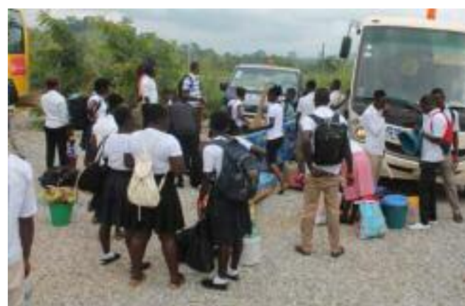
Beneficiaries being bussed to school