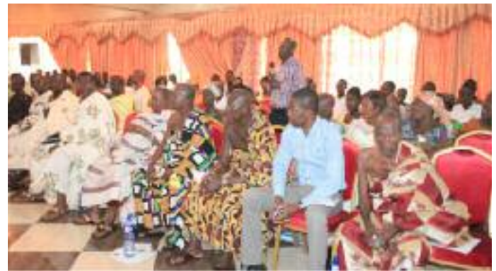
Stakeholders discussing the annual report