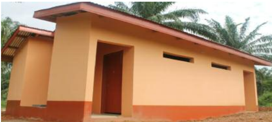
Ntronang vault chamber