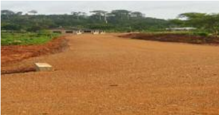
The constructed Methodist church road at Adausena