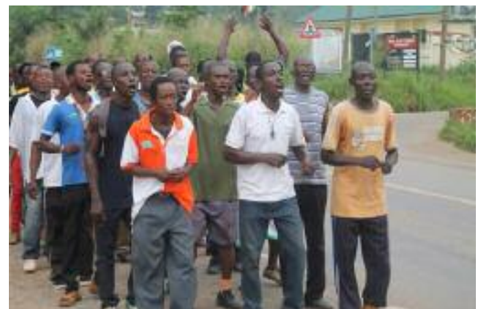
Physical training session of watchdog committee members