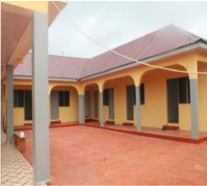
The expanded chief's palace at Afosu