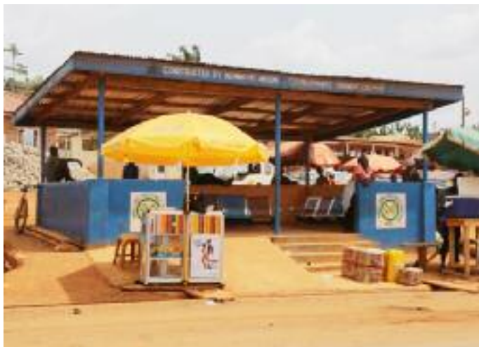
Plate 14: Afosu Passengers Shed

The Afosu community lorry park was without a passengers shed that provides shelter to passengers commuting to and from the lorry park. This predisposed passengers to the vagaries of weather. In view of this, a passenger shed was constructed. Picture of the bus stop shed is shown below.