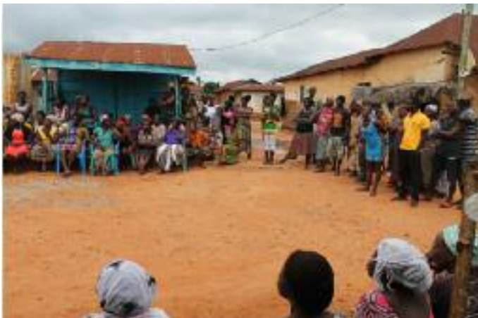
Plate 9: Microcredit programme awareness session

Further discussions between micro-credit committee members, SDC leadership, the secretariat and experts from GIZ revealed that the micro-credit scheme needs to be restructured to Cooperative Credit Union to ensure sustainability and appropriate level of loan recovery. The partnership opportunity between the Foundation and GIZ will ensure that the delivery of the microcredit programme is improved.