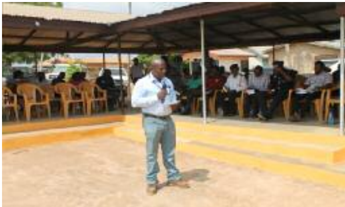
Interim General Manager of Newmont Akyem delivering a speech at the inauguration ceremony

A total of 85 Watchdog committee members were selected by the communities with the approval of the District Police Commander after background checks for any criminal records were conducted. The Committee members went through a ten-days training program from the 14th to 25th November to build their capacity to support security issues within the communities. Topics covered during the training programme included Human Rights, Domestic Violence, Community Policing and Patrolling, Handling of Crime Suspect and Criminals, Crime Combating and arrest, Crime Reporting. The watchdog committee was formally inaugurated on Tuesday, 20th December after which their work officially begun. Operational tools including torchlights, uniforms, and tags among others were provided to them. Below are some of the pictures during the training sessions and inauguration.