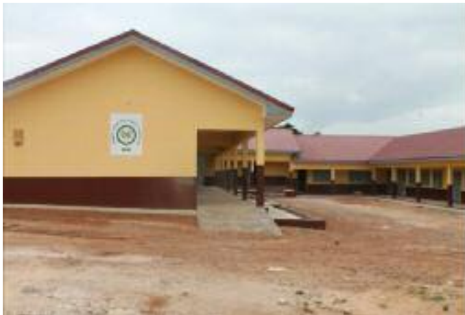
8-unit primary school block for Old Abirem