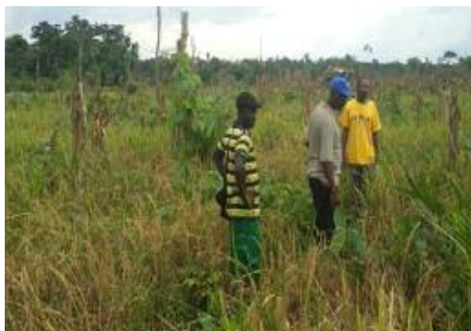
Farm visit by District Director of MoFA and Foundation Executive Secretary