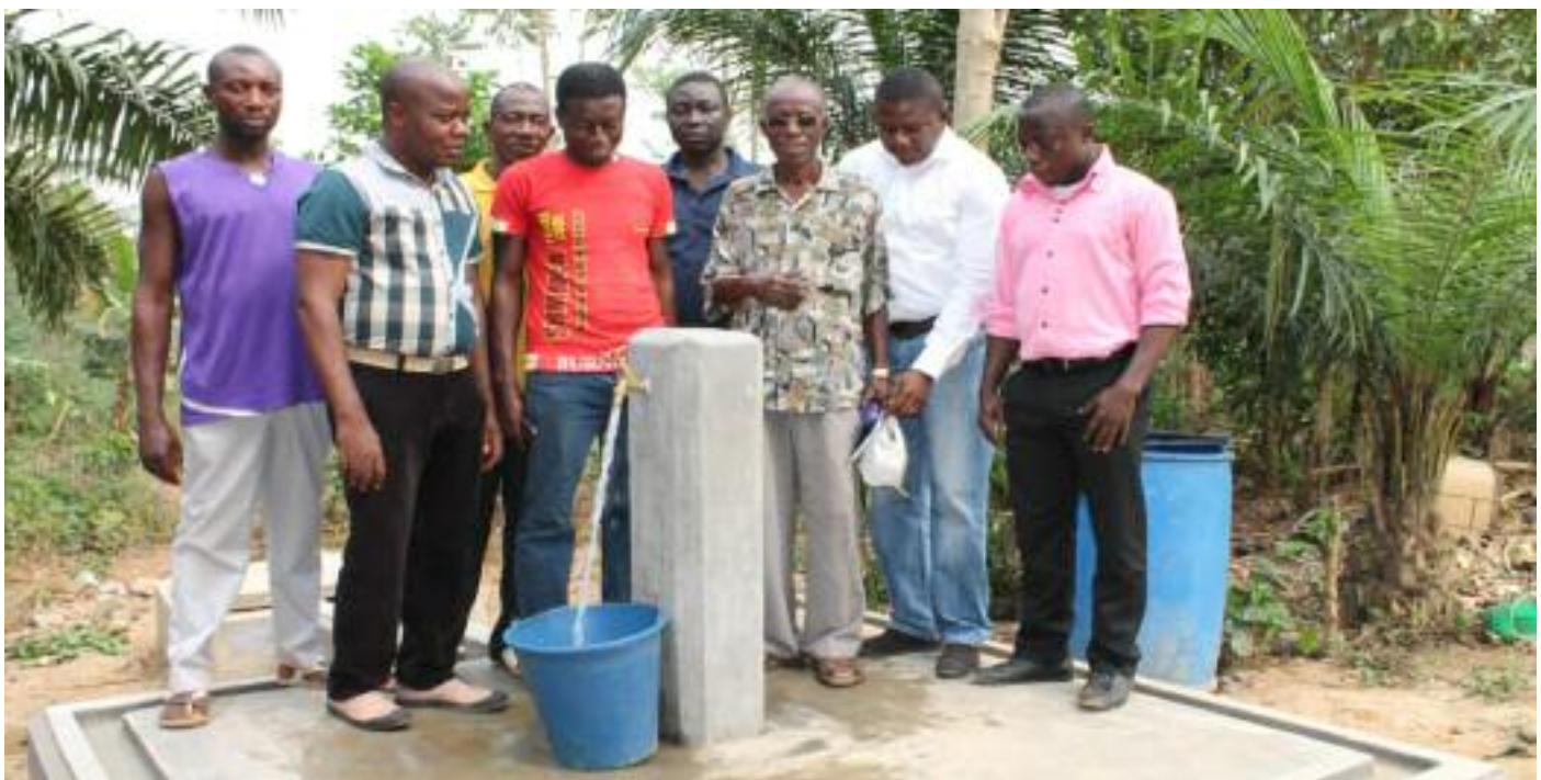
Handing over of stand pipe extended to newly built areas in Hweakwae