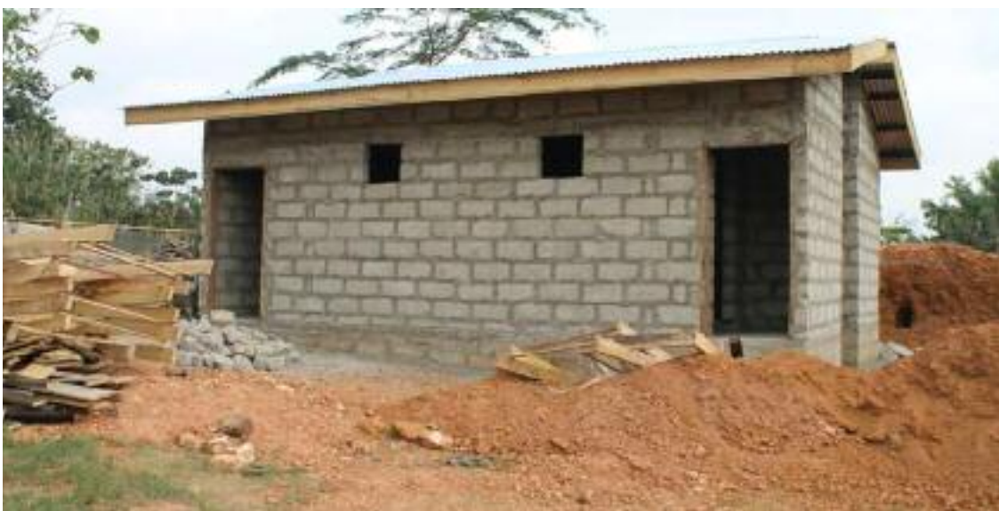
New Abirem Cluster of Schools 10-seater Vault Chamber