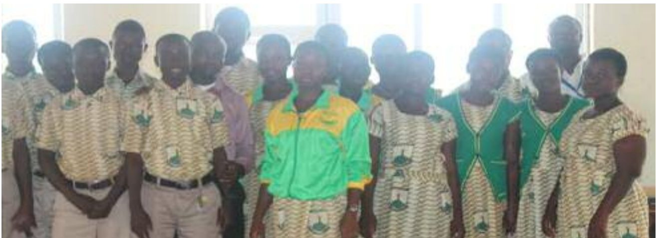
Group photograph with scholarship beneficiaries of Nkwatia Senior High School