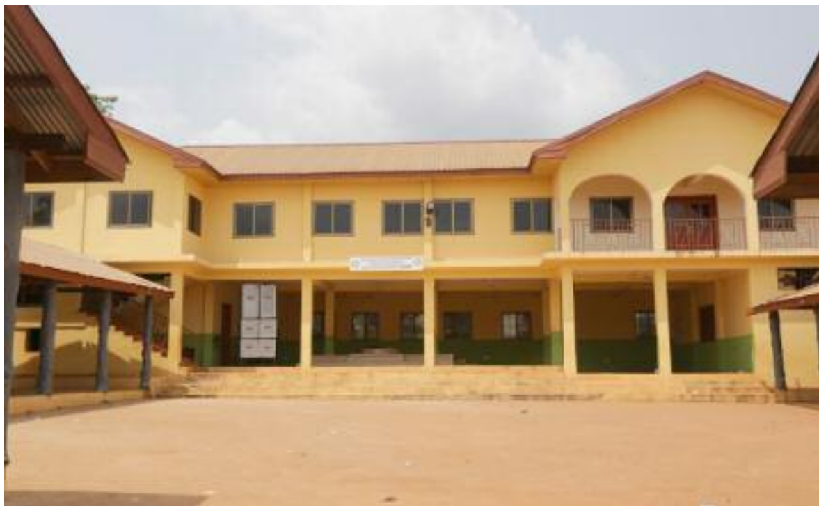
Afosu Durbar Ground