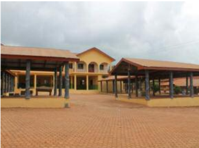
The durbar ground with conference room at Afosu