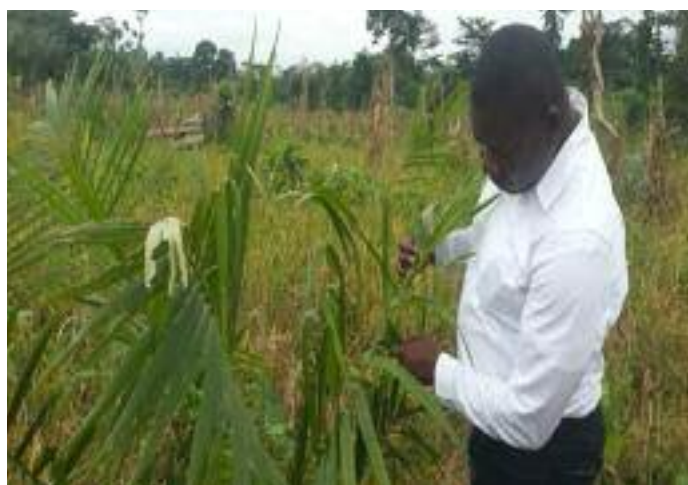
Plate 10: Resettlement Community 28.5 oil palm plantation

Agriculture is the major source of income for the Newmont Akyem Mine Communities. Encouraging improved agriculture production is therefore critical for sustainable development of the communities. The purchase of a 28.5 acre farmland under a lease agreement for the Resettlement community to establish oil palm plantation represent the key agriculture intervention made in 2016. Prior to the acquisition of the farmland, survey works and a search for the true owner of the land were done through the services of a professional surveyor to ensure due diligence in the acquisition of the land. A total of 19.5 acres is currently being cultivated. It is envisaged that an Oil palm-processing factory will be established within the Resettlement community to process the palm fruits from the farm as well as that of individual farmers to create employment opportunity and improve the economic situation of the community.