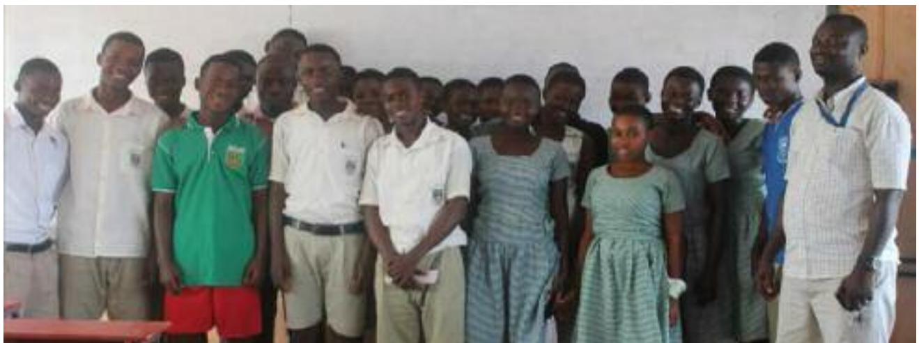
Group photograph with scholarship beneficiaries of Mpraeso Senior High School