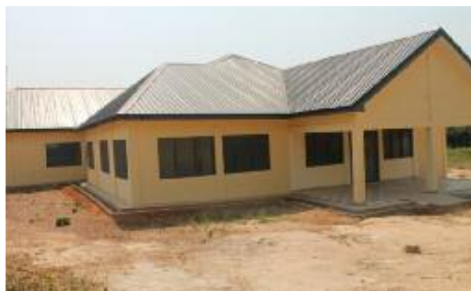
Plate 11: Afosu Clinic